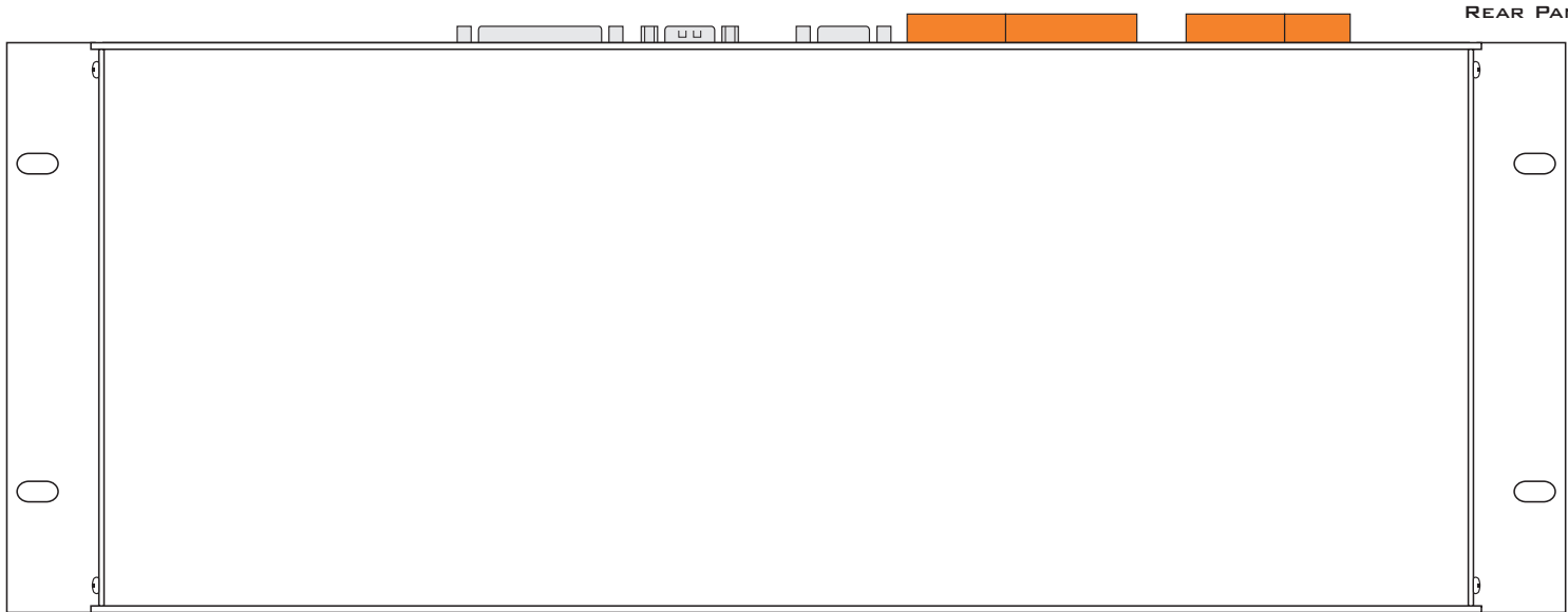
REAR PANEL VIEW